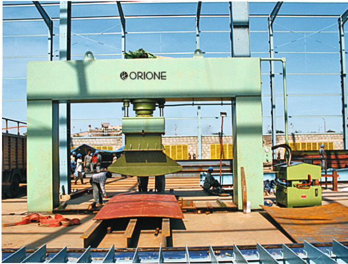
500 ton Metal Forming Press (Ship building industry)