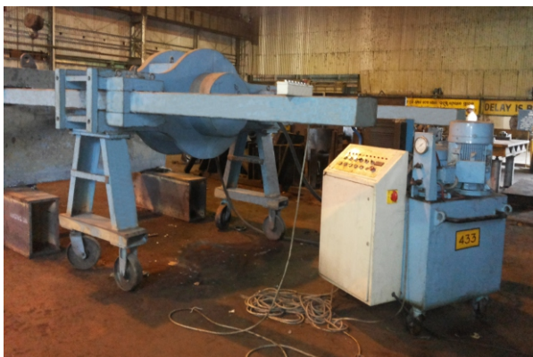
400 ton Horizontal Press (Steel plant - shaft dismantling)