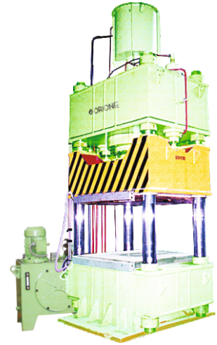
600 ton Semi Automatic Moulding Press (Electrically heated platen)