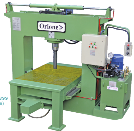
100 ton Hydraulic Roll Bed Press (Hydraulic travel of cylinder & frame)