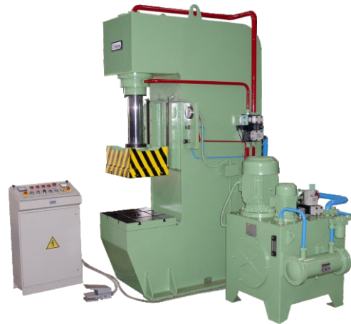
150 ton Metal Forming Press