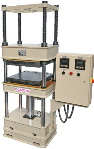
20 ton Lab Press (Electrically heated platen)