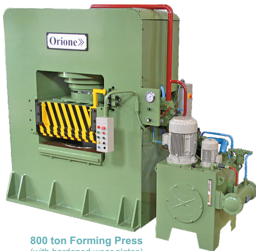
800 ton Forming Press (with hardened wear plates)