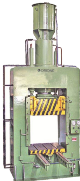
250 ton Semi-Automatic Moulding Press (Hydraulic table travel, Electrically hardened plated)