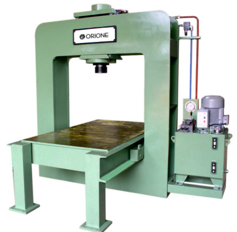
100 ton Hydraulic Roll Bed Press (Manual travel of cylinder & frame)