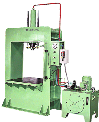
20 ton Push Fitting Press