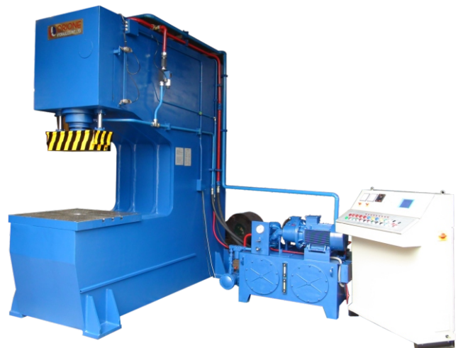
100 ton Semi Automatic PLC Metal Forming Press (With Electronic pressure and stroke control)