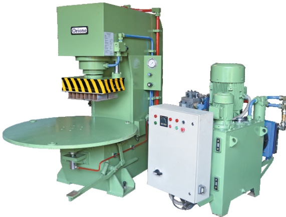
100 ton 3 Station Indexing Press, Semi Automatic For Tamarind Cube